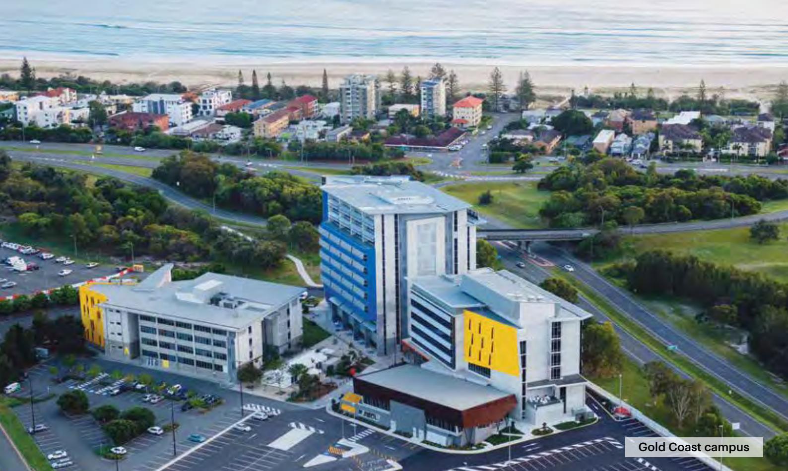
Gold Coast campus

The campus is spread across three contemporary buildings that house innovative learning spaces, health science laboratories, lecture theatres with live video broadcasting, computer labs and student lounges. More than 4,900 students study on campus at the Gold Coast.